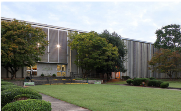
1068 Historic Highway 17 | Toccoa, GA 30577